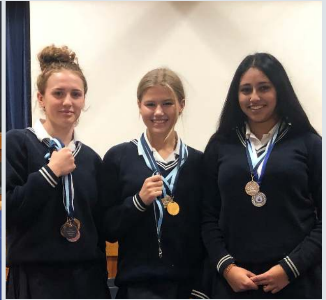
Congratulations to our Year 11 swimming champions!